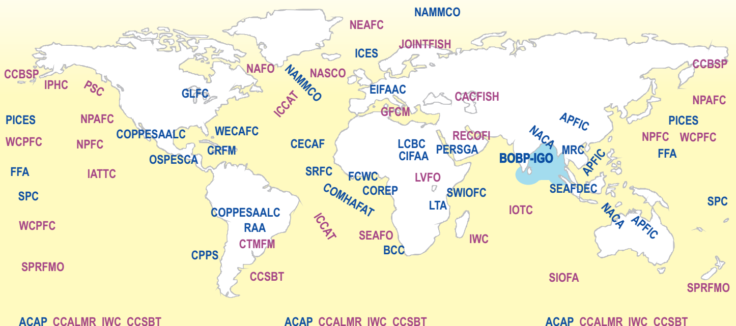
Indicative map of RFBs around the globe

Currently, there are about 30 RFABs and 23 RFMOs.